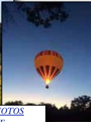
SEE ALL THE PHOTOS CLICK HERE