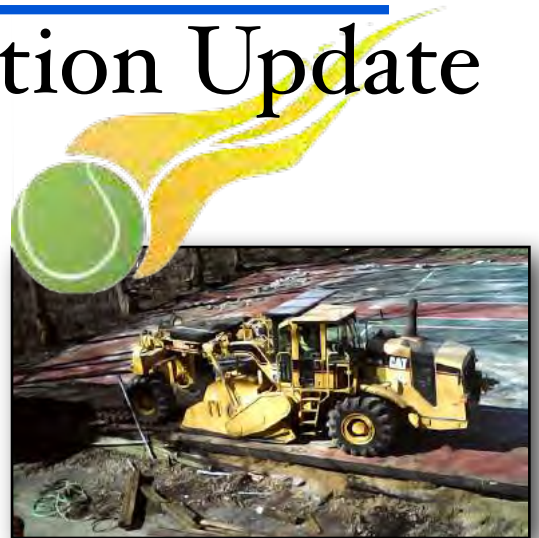
Courts as the grinding of top layers begins