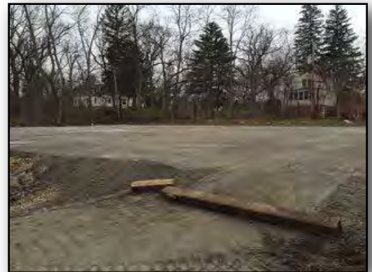
Stabilized surface prior to paving