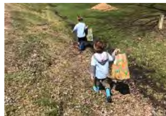
Milne Boys cleaning up on Earth Day '18