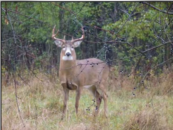
Tower Lakes Buck