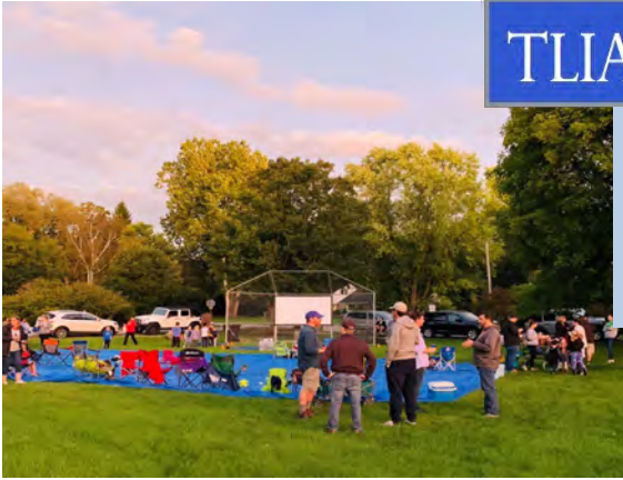
Family Movie Night "Home Alone" A beautiful night for Family fun on the Soccer Field!