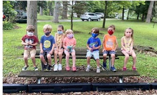
Future friends, for sure!

A great group of incoming kindergartners met up at Aram Park in July.