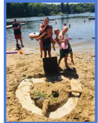
TOWER LAKES BEACH