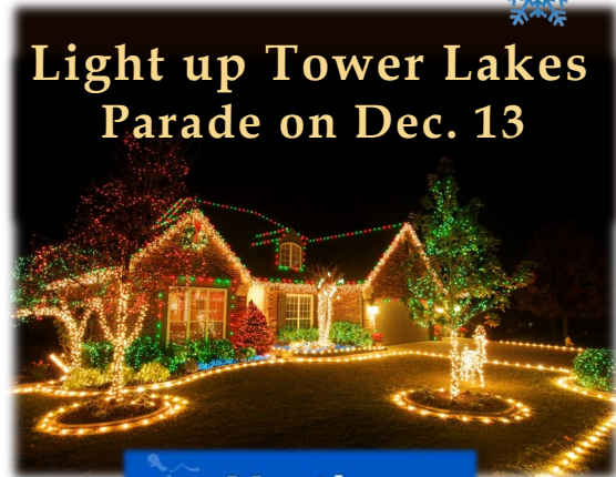
TLIA Youth Committee

If you would like your house to be on the route, please email your address to youth@tlia.org . no later than December 10